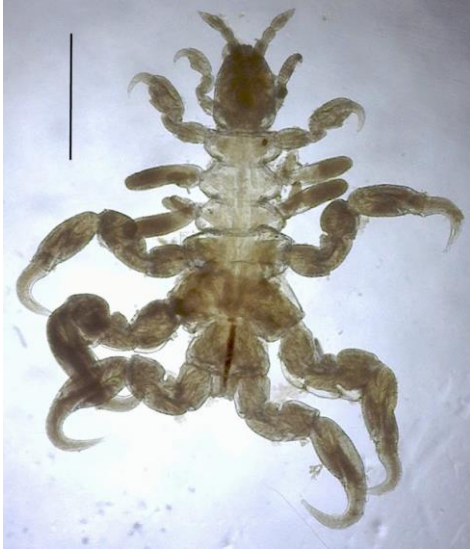
Fig. 3. Neocyamus physeteris embryo. Scale bar: 1 mm.

Fig. 3. Embrió de Neocyamus physeteris . Escala gràfica 1 mm.