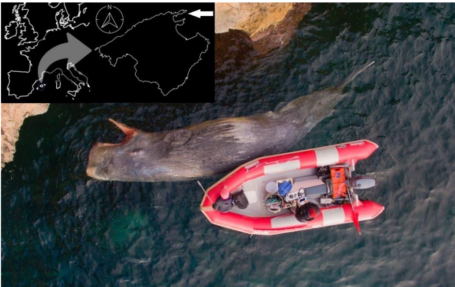
Fig. 4. Physeter macrocephalus . Female specimen stranded on the north coast of Mallorca (white arrow), on which the Neocyamus physeteris specimens were collected.

The sampled female specimens had the marsupium with the embryos ( pulli ) already in their last phase of development. The pulli measured 2.84 mm and were practically identical to the miniature adults, with the exception of a lower development of the external gills (Fig. 3). According to Oliver & Trilles (2000), the number of external gills increases in correlation with the size of the individuals.